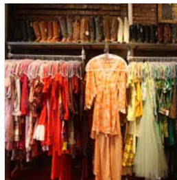
The glut of vintage dresses.

Groovy Atlanta-based vintage chain the Clothing Warehouse opened its first store in New York this week, bringing a stash of sixties and seventies dresses, pristine vintage boots, Western button-downs, and retro T-shirts to Nolita. Scuffed red flooring, exposed brick, and blue accent walls lend an all-American vibe. Standout pairs of red, violet, and aqua boots are mixed with more common cowboy styles. Roughly equal numbers of men and women were browsing the shelves when we dropped in — a testament to the impressive selection of plaid shirts, fifties workwear, and leather jackets. Though the store carries some true vintage accessories — drawers full of coiled leather belts and fifties Lucite bangles — the sunglasses are all new (as are, amusingly, slap bracelets touting Paula Abdul and M.C. Hammer). But the real draw is the dresses, just in time to brighten up your spring wardrobe: sequined eighties frocks, kitschy sixties prints, and neon minidresses for around $60 apiece. Click ahead to scope out the store.